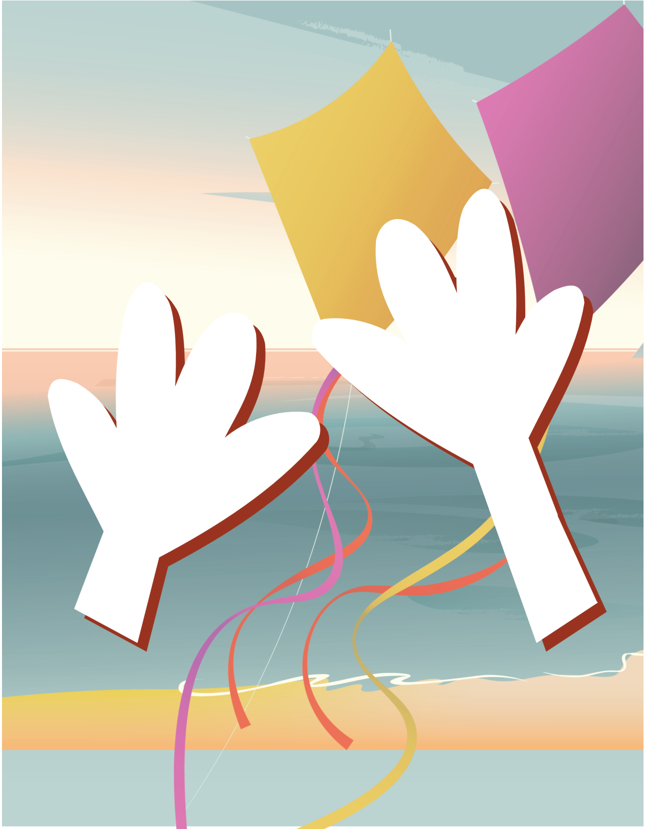
Item 4. Gospel Icons