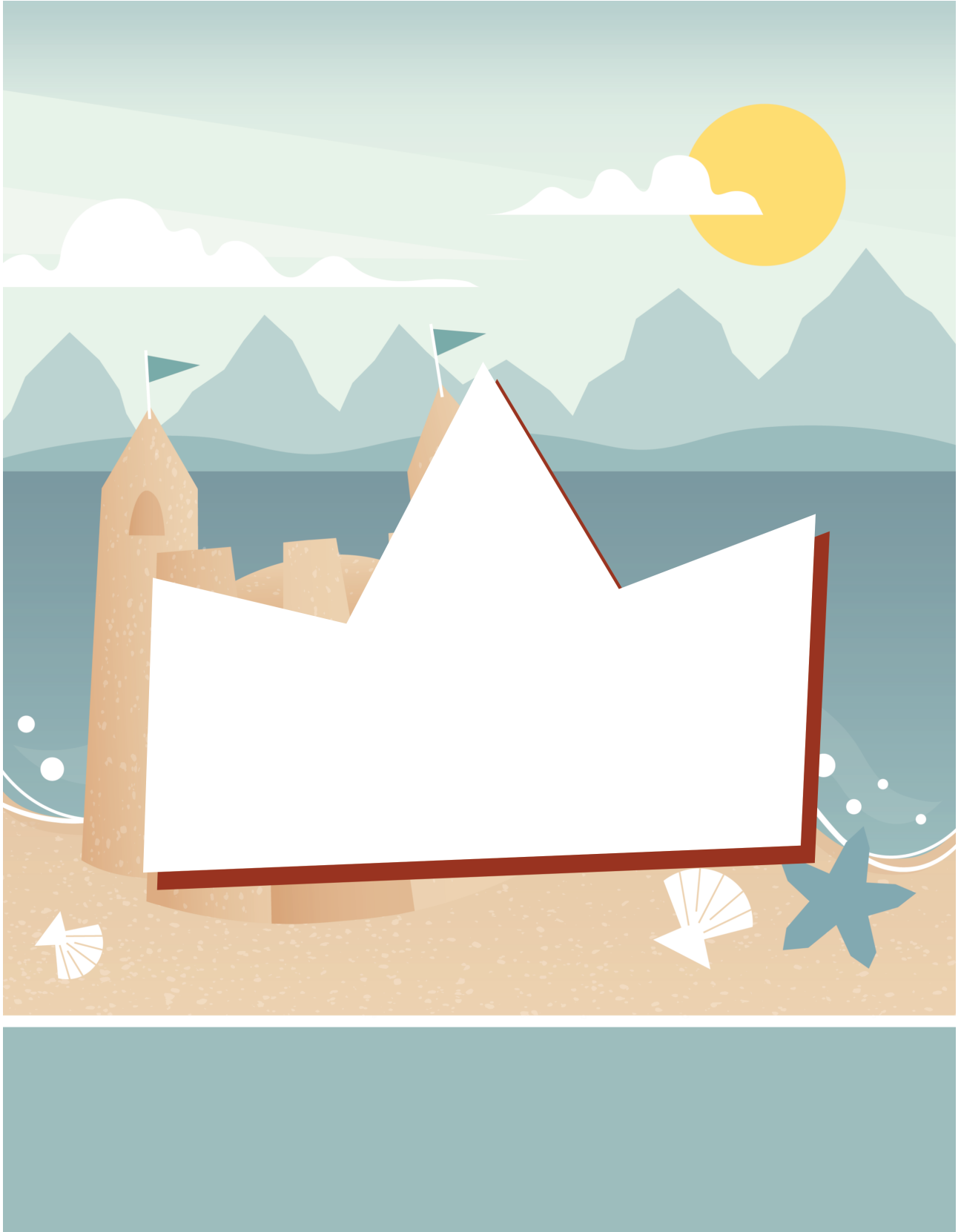
Item 4. Gospel Icons