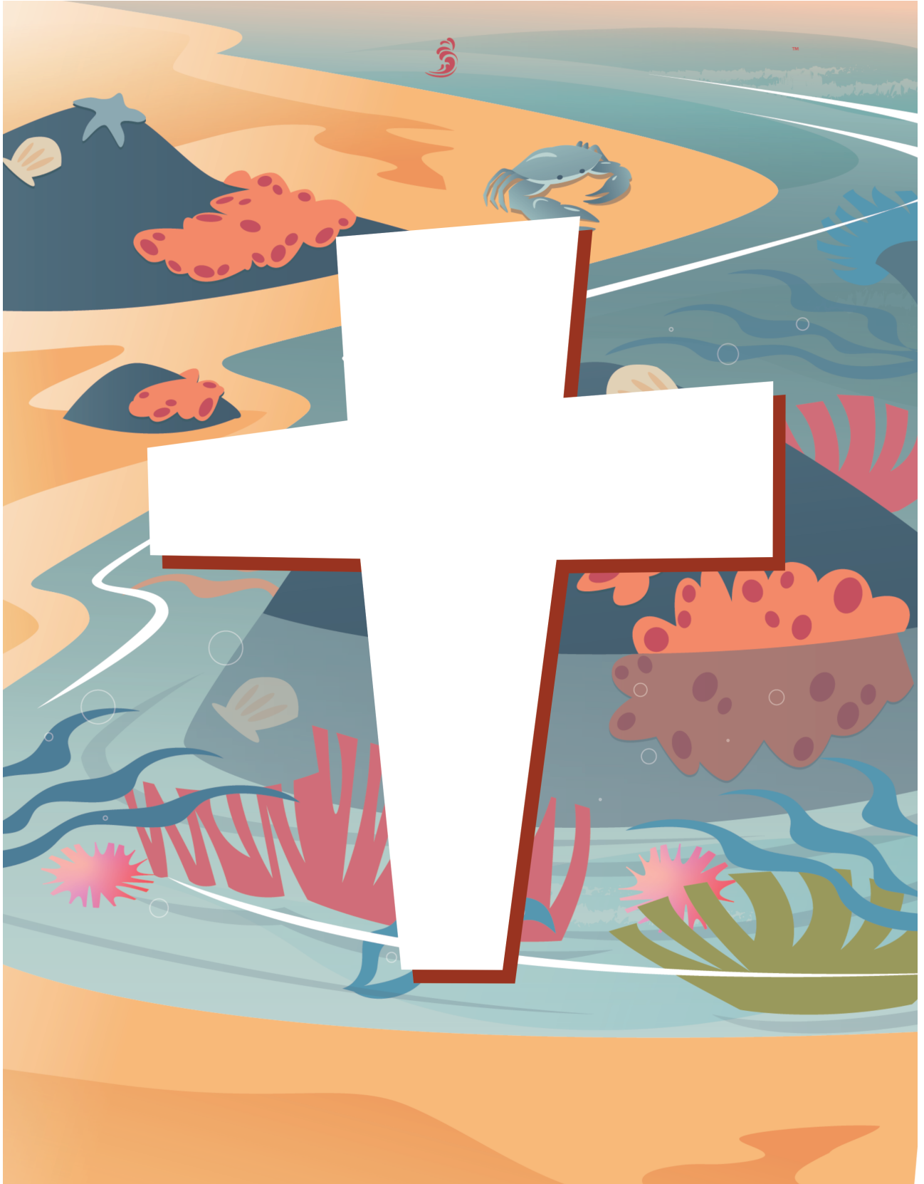
Item 4. Gospel Icons