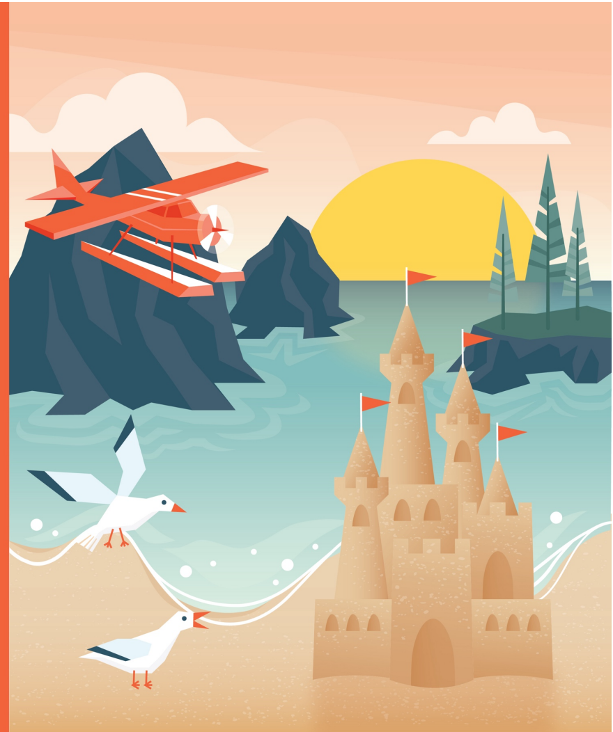
Item 2. Characteristics — Print on cardstock. Cut each image in half to separate the definition (on solid background) from the term (on sandcastle image background).

PRETEENS ARE MOVING FROM BEING CONCRETE THINKERS TO EXPLORING MORE ABSTRACT IDEAS. WHICH IS AN OPPORTUNITY WE CANNOT MISS!