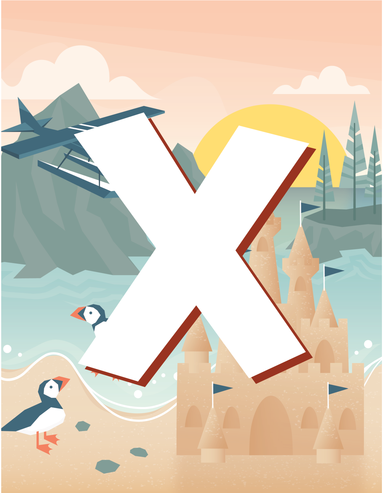
Item 4. Gospel Icons