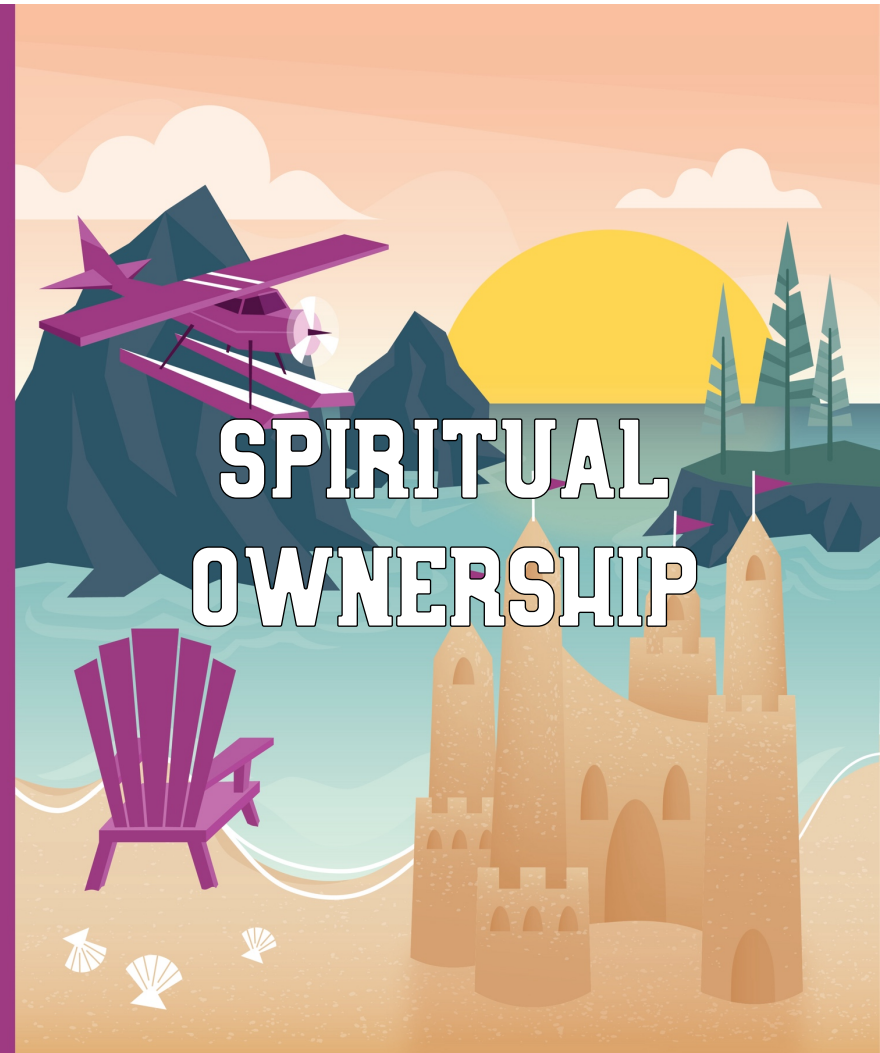
Item 2. Characteristics — Print on cardstock. Cut each image in half to separate the definition (on solid background) from the term (on sandcastle image background).

PRETEENS ARE TAKING MORE OWNERSHIP OF THEIR FAITH AND ARE LEARNING HOW TO NAVIGATE LIFE CHOICES BASED ON THE BIBLE.