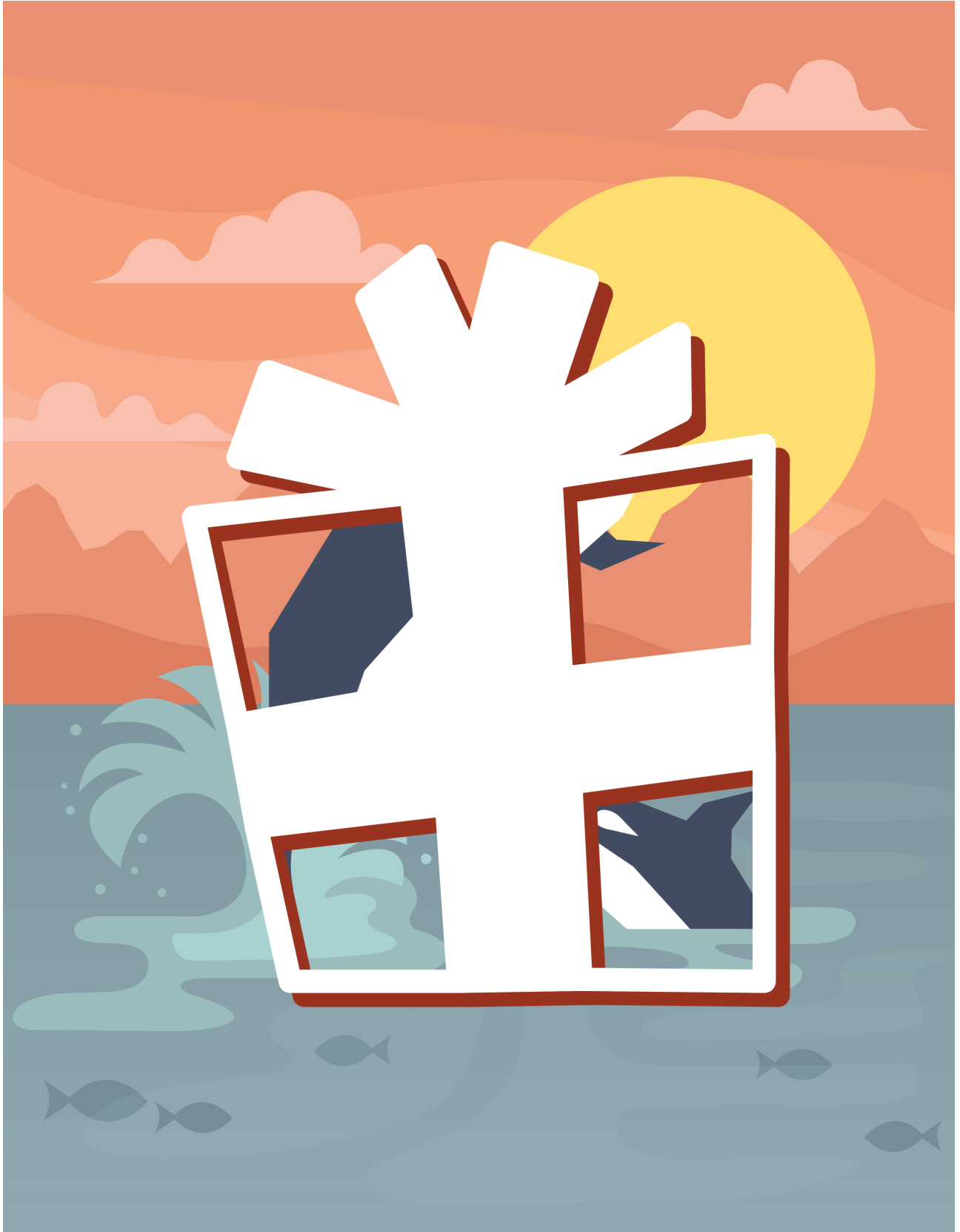
Item 4. Gospel Icons